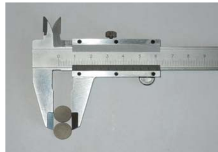
Fig.2. Photograph of the developed porous Ni support

The sintered supports were studied by scanning electron microscopy (SEM), and as it is shown in Fig.3. the porous nickel supports have relatively small pores with uniformity and the surface is smooth enough that thin films can be deposited on it without surface modifications, but in the same time presents a porosity high enough to be permeable.